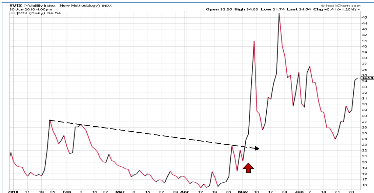
Volatility Index (VIX) January 1, 2010 - June 30, 2010